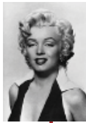
Sukashi-Type A "2-Kaicho"