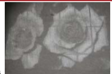
Design Example - Roses

This embossing is transferred to the natural fibres, compressing and reducing their thickness in that area. Because the patterned portion of the page is thinner, it transmits more light through and therefore has a lighter appearance than the surrounding paper. If these lines are distinct and parallel, and/or there is no watermark, then the parchment is termed laid parchment. This method is called "filtered"