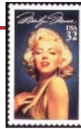
Sukashi-Type B "Filter"