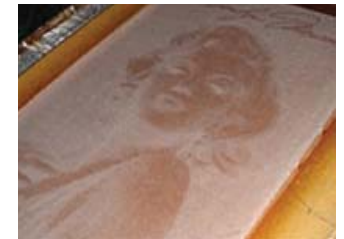
Wet parchment in a vat

This embossing is transferred to the natural fibres, compressing and reducing their thickness in that area. Because the patterned portion of the page is thinner, it transmits more light through and therefore has a lighter appearance than the surrounding paper. If these lines are distinct and parallel, and/or there is no watermark, then the parchment is termed laid parchment. This method is called "filtered"