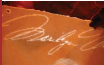
Detail For Letters