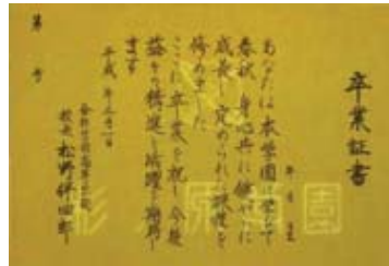
Diploma (16"x 24")

A watermark is a recognizable image or pattern in paper that appears lighter when viewed by transmitted light (or darker when viewed by reflected light, atop a dark background)