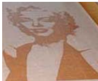
Wet parchment in a vat

Type A watermark is called the shaded watermark. A shaded watermark incorporates tonal depth and creates a grey-scale image. Instead of using a wire covering for the dandy sheet, the shaded watermark is created by areas of relief on the sheet's own surface. A watermark is very useful in the examination of parchment because it can be used for dating, identifying sizes, mill trademarks and locations, and the quality of parchment.