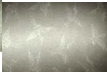
Pattern Example - Cranes