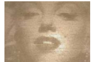
Detail For Artwork