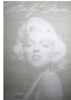
Marilyn Monroe Type B (24"x 36")