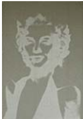
Through the light (24"x 36")