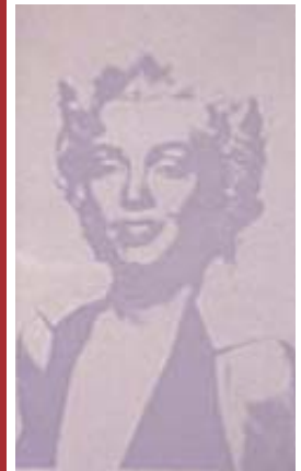
Marilyn Monroe Type A (24"x 36")