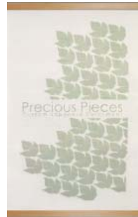
Wall Hanging (24"x 36")