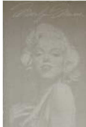
Through the light (24"x 36")