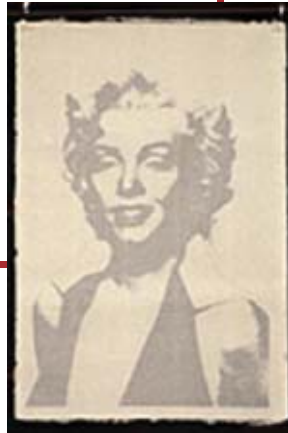
On Black Background (24"x 36")