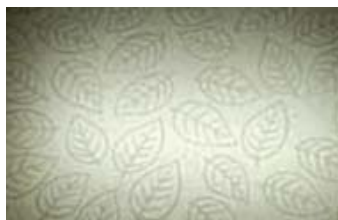
Pattern Example - Leaves

Type A watermark is called the shaded watermark. A shaded watermark incorporates tonal depth and creates a grey-scale image. Instead of using a wire covering for the dandy sheet, the shaded watermark is created by areas of relief on the sheet's own surface. A watermark is very useful in the examination of parchment because it can be used for dating, identifying sizes, mill trademarks and locations, and the quality of parchment.