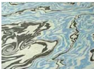
6. Traditional black and blue ink pattern-A (Strong contrast)