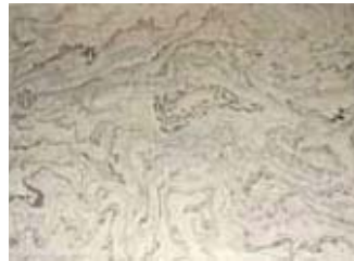
2. Black ink shading pattern with slightly wider space between the lines