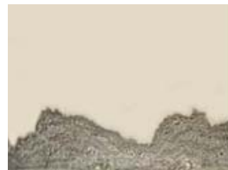
4. Dark ink pattern on bottom only