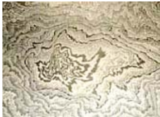
1. Black ink shading pattern