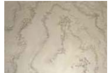
3. Light ink pattern with wide space between the lines