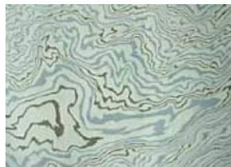
7. Traditional black and blue ink pattern-B (Soft contrast)