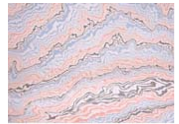
9. Traditional black, blue and red ink pattern-B (Soft contrast)