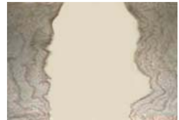
5. Ink pattern on right and left sides only (blank space on center)